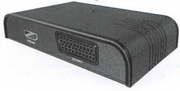
SCART to HDMI converter