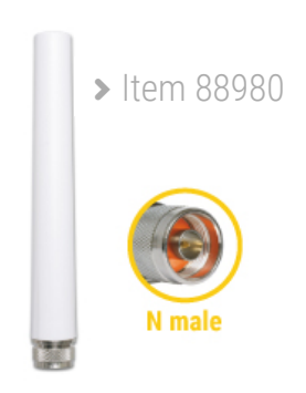
LTE / UMTS / GSM Antenna N plug, 2.5 dBi, omnidirectional, outdoor