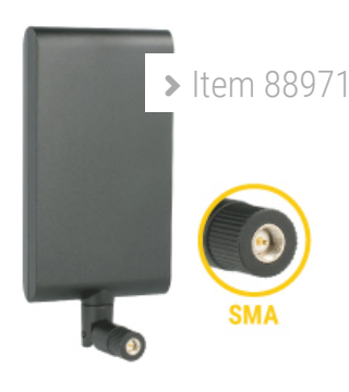
LTE / UMTS / GSM Antenna SMA, 1 ~ 4 dBi, direkcional, rotatable, flexible joint