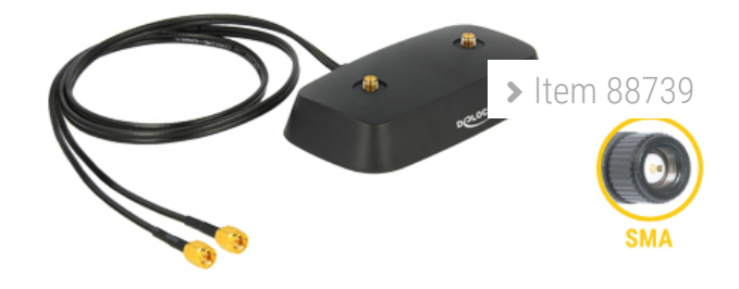
Antenna Base LTE MIMO 2 x SMA jack, 2 x SMA plug, low loss, cable length 1 m

The current state of the art enables the connection of two antennas at the maximum. A suitable antenna base for this purpose is, for example, the item 88739: