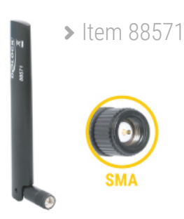
LTE / UMTS / GSM Antenna SMA, -0,8 ~ 3 dBi, omnidirectional, flexible joint