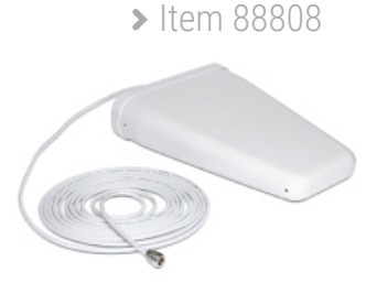
Antenna N jack, 8 ~ 9 dBi, directional, outdoor