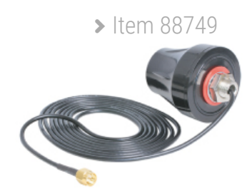
LTE / UMTS / GSM Antenna SMA, 2 dBi, omnidirectional, outdoor